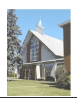
Our Lady of Victory 490 Charles Street Gatineau, Québec J8L 2K5