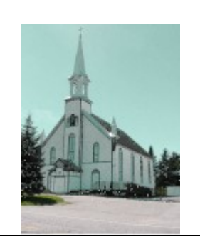
St. Malachy 3889 Route 315 Mayo, Québec J8L 3Z8