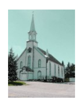
St. Malachy 3889 Route 315 Mayo, Québec J8L 3Z8

Sunday 9:00 a.m. Celebration of the Eucharist Saturday 6:30 p.m.