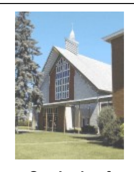
Our Lady of Victory 490 Charles Street Gatineau, Québec J8L 2K5