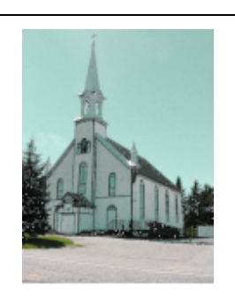
St. Malachy 3889 Route 315 Mayo, Québec J8L 3Z8

Sunday 9:00 AM Celebration of the Eucharist Saturday 7:00 PM