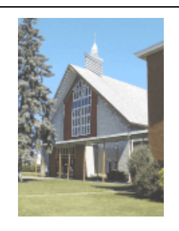
Our Lady of Victory 490 Charles Street Gatineau, Québec J8L 2K5