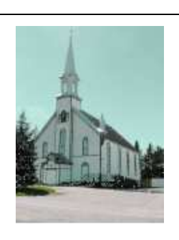
St. Malachy 3889 Route 315 Mayo, Québec J8L 3Z8