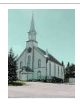
St. Malachy 3889 Route 315 Mayo, Quebec J8L 3Z8

Sunday 9:00 AM Celebration of the Eucharist Saturday 7:00 PM