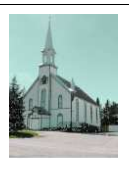
St. Malachy 3889 Route 315 Mayo, Quebec J8L 3Z8