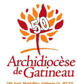
180, boul. Mont-Bleu, Gatineau Qc, J8Z 3. www.diocesegatineau.org